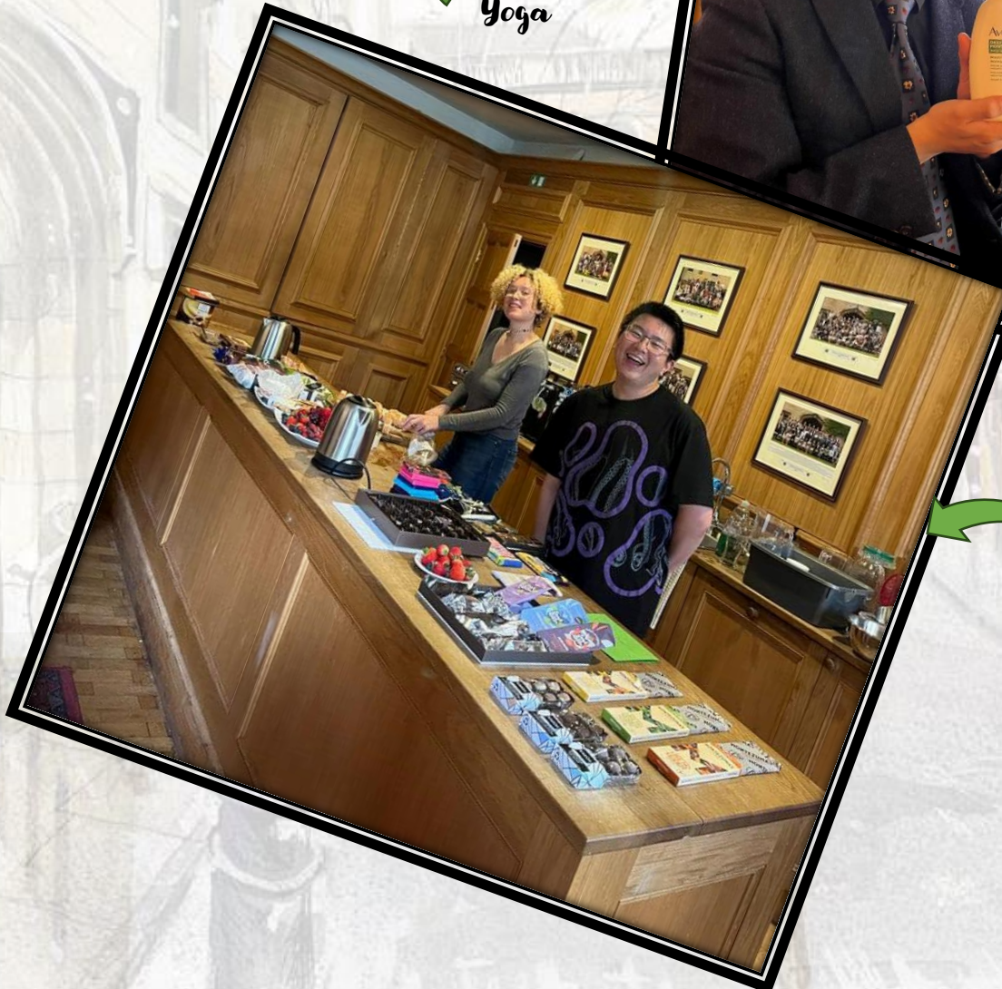
CHOCOLATE Welfare Tea